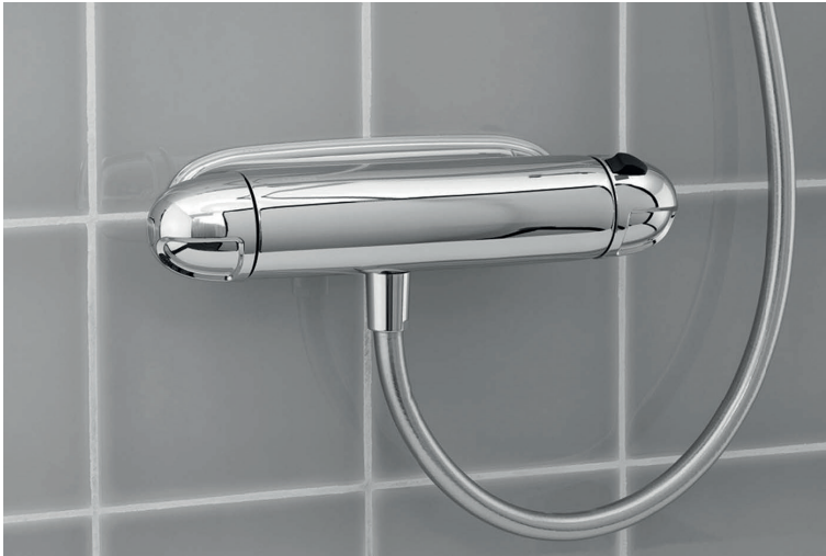
9210 Pressure Balanced Thermostatic Shower Mixer