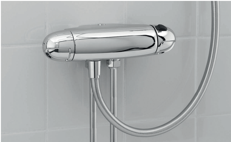
9250 Pressure Balanced Thermostatic Shower Mixer